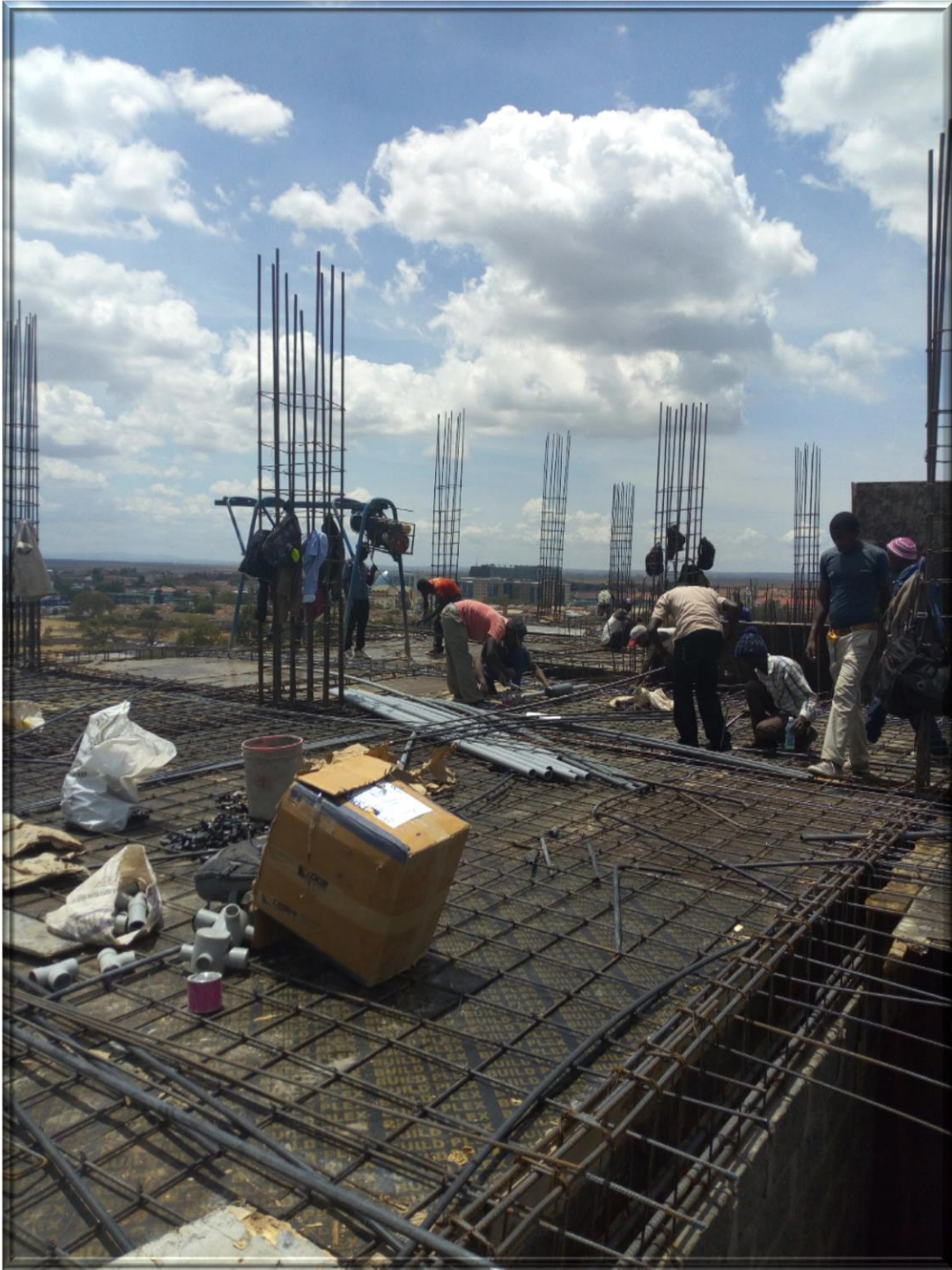
Fig. O1. Preparation of concreting of the 10 th steel fixing on going